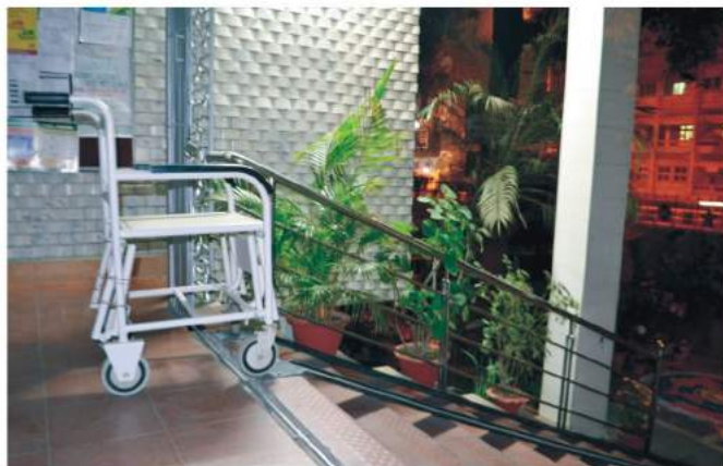
Wheel chair & Ramp for Physically Challenged Students/Persons