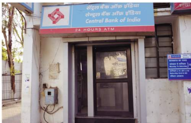
In Campus ATM & Bank