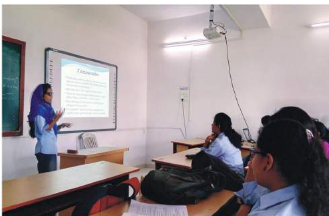
Modern ICT Classroom