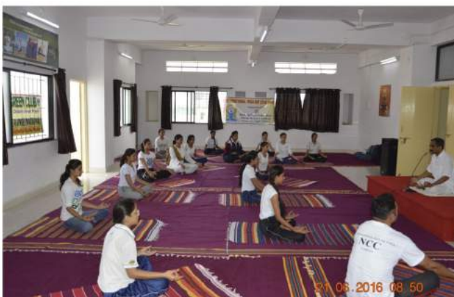
Yoga & Meditation Centre