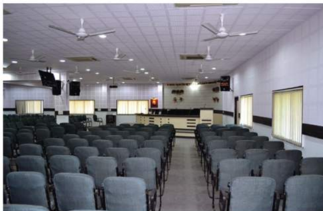
Sophisticated Conference Hall