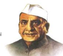
Dr. Panjabrao alias Bhausaheb Deshmukh Founder President