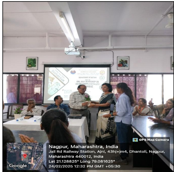
Chief Guest felicitated by Memento and Sapling