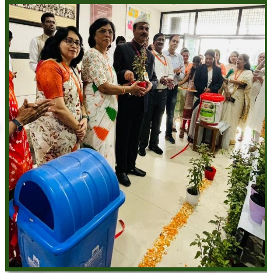
Principal sir inaugurating 'Ek Ped Bhart Maa Ke Naam'