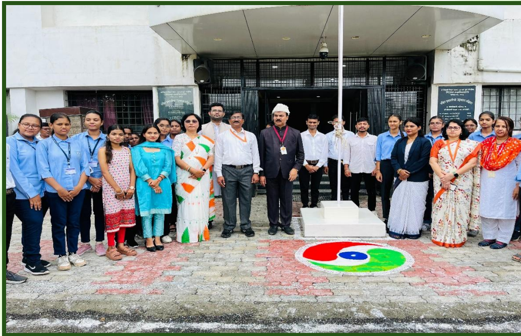
Principal sir along with other faculty members and students of Botany Department