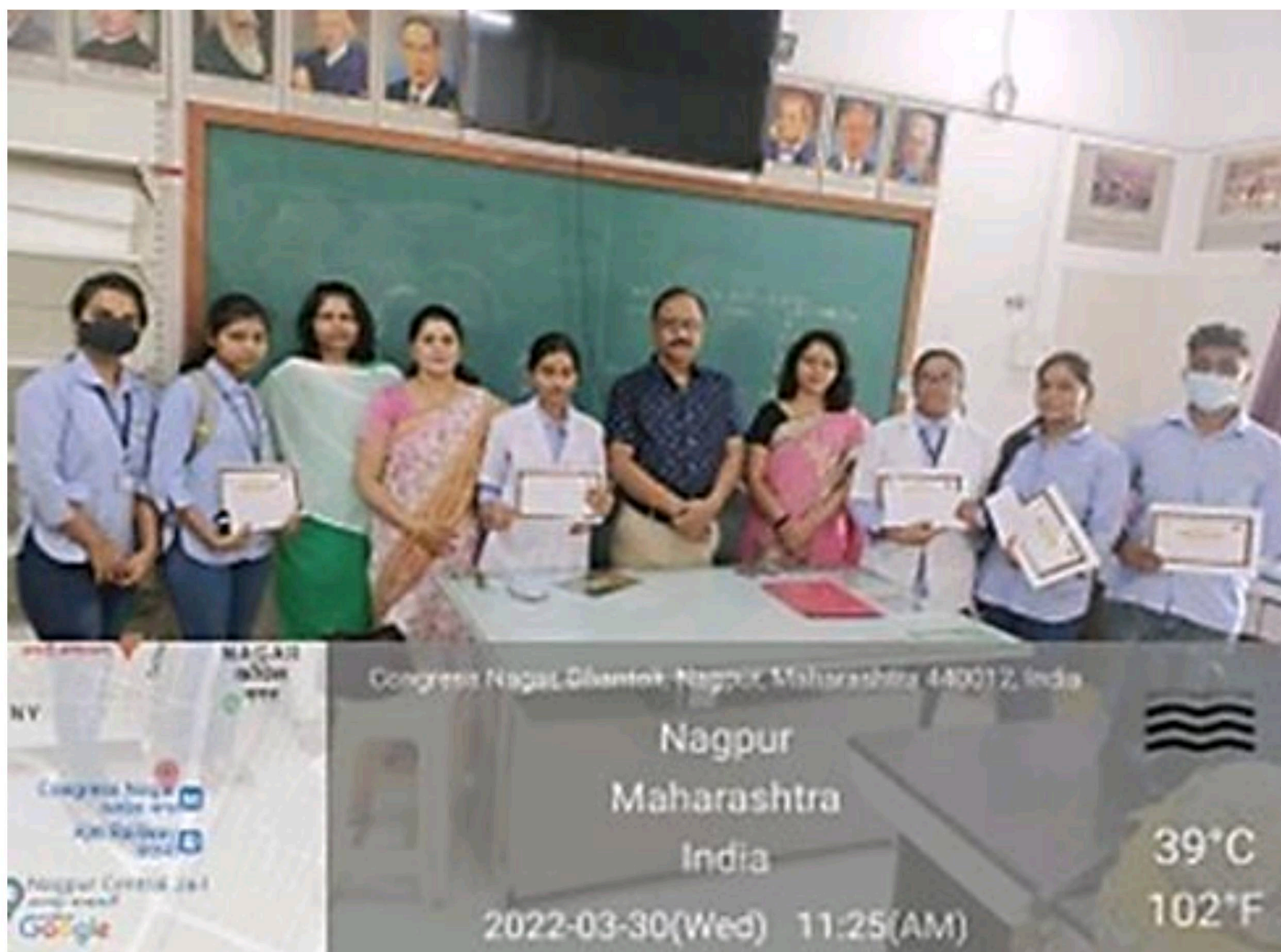
Certificate and cash prize distribution of WET LAND DAY Programme & AIDS DAY Programme in Department Of Zoology in offline class.