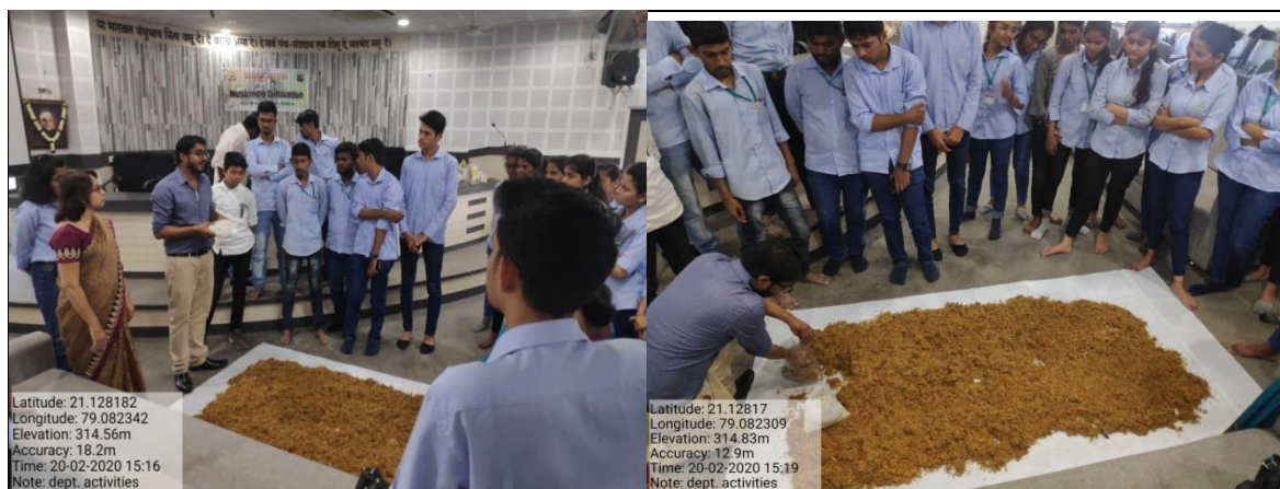
One Day Workshop on Edible Mushroom Cultivation