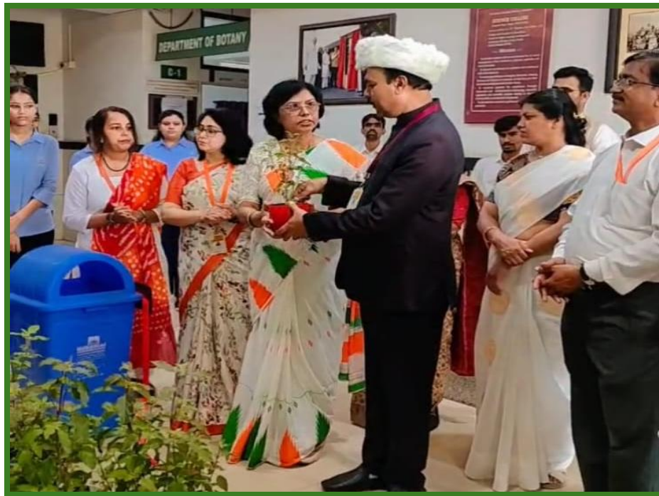
Principal sir inaugurating 'Oxygen Park'