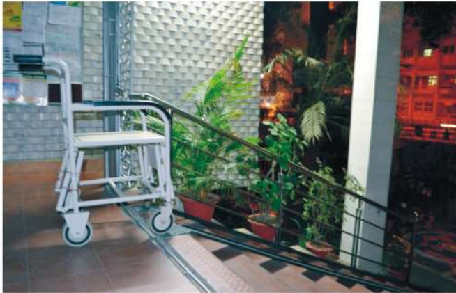
Wheel chair & Ramp for Physically Challenged Students/Persons