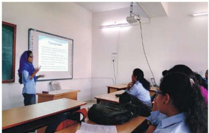
Modern ICT Classroom