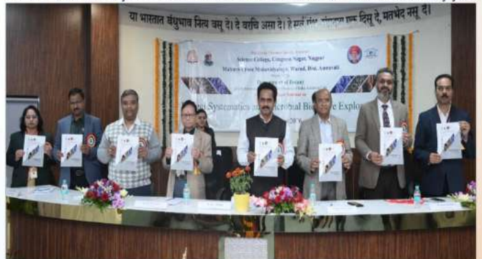
Publishing Souvenir during One Day National Seminar on "Fungal Systematics & Microbial Bioactive Exploration" held on 12 th January 2026