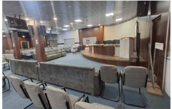
Sophisticated Conference Hall