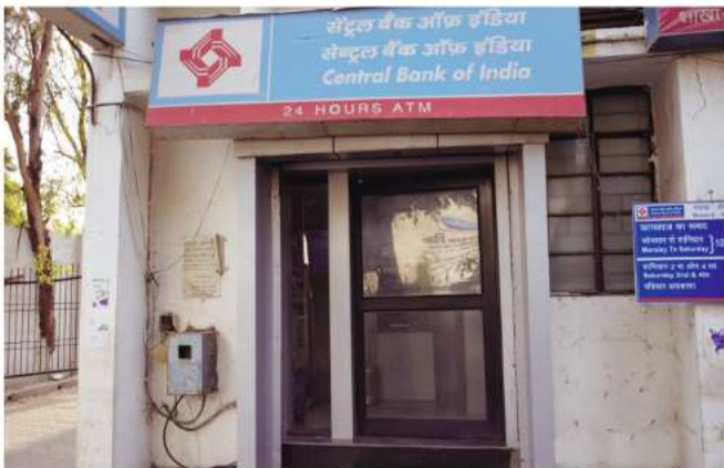
In Campus ATM & Bank