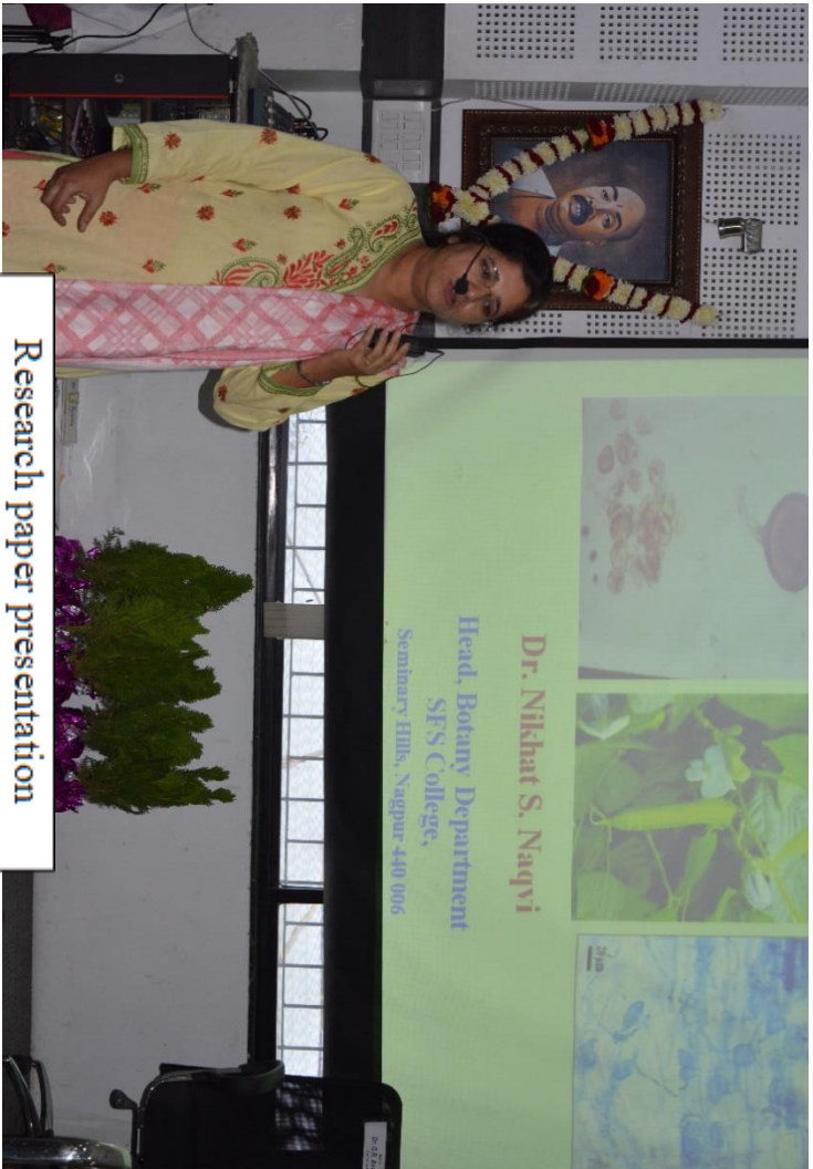
Research paper presentation