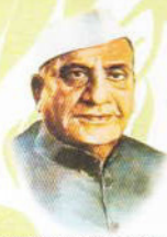
Dr. Panjabrao alias Bhausaheb Deshmukh

An Institution recognized by UGC as 'College with Potential for Excellence'