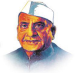
Dr. Panjabrao alias Bhausaheb Deshmukh Founder President