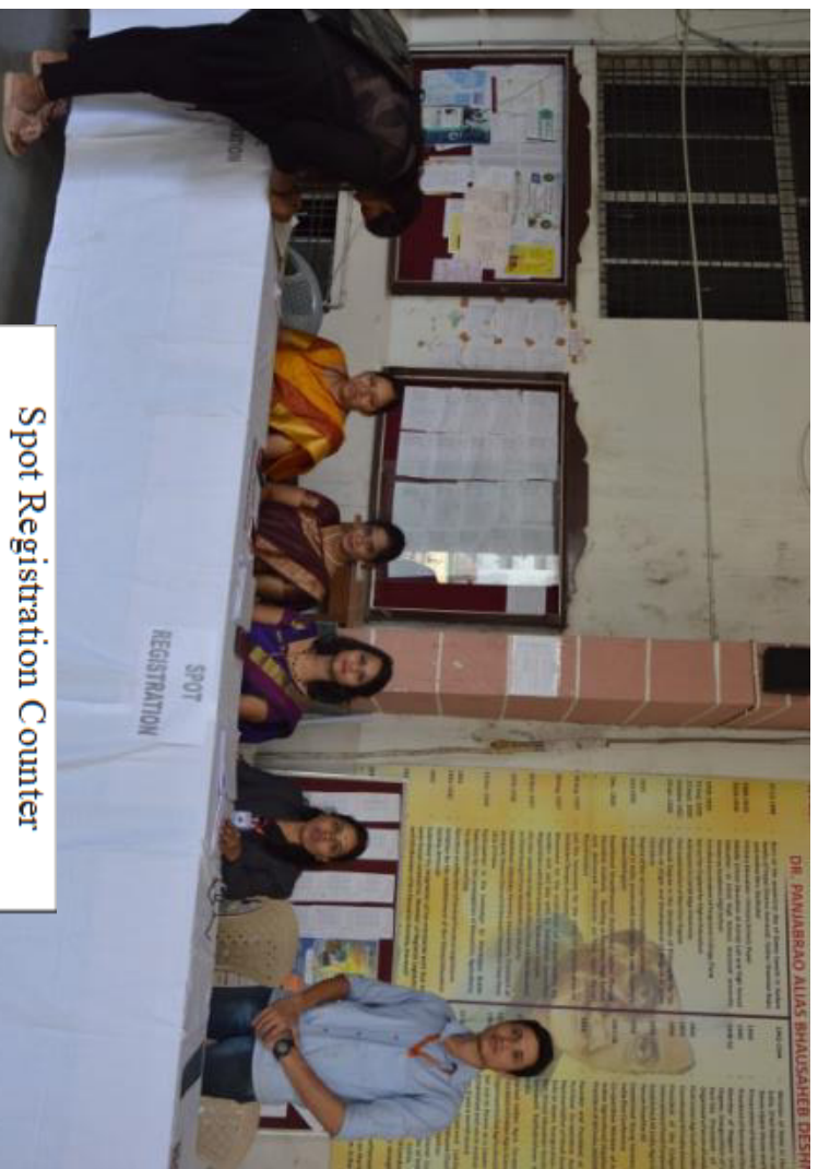
Spot Registration Counter