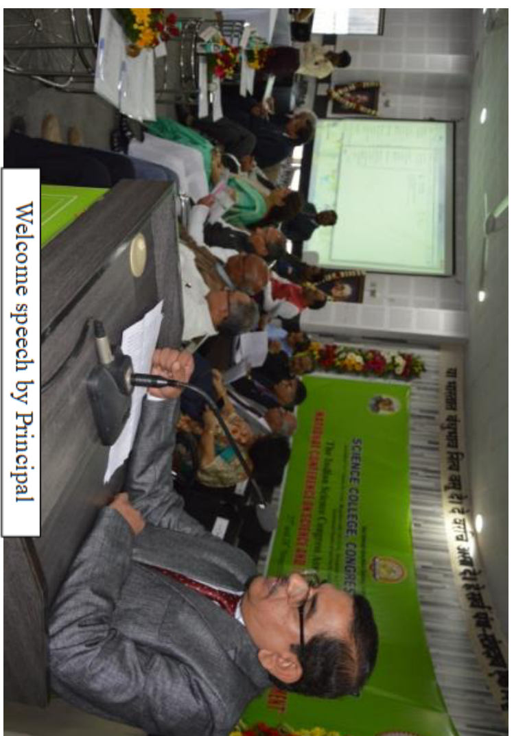
Welcome speech by Principal