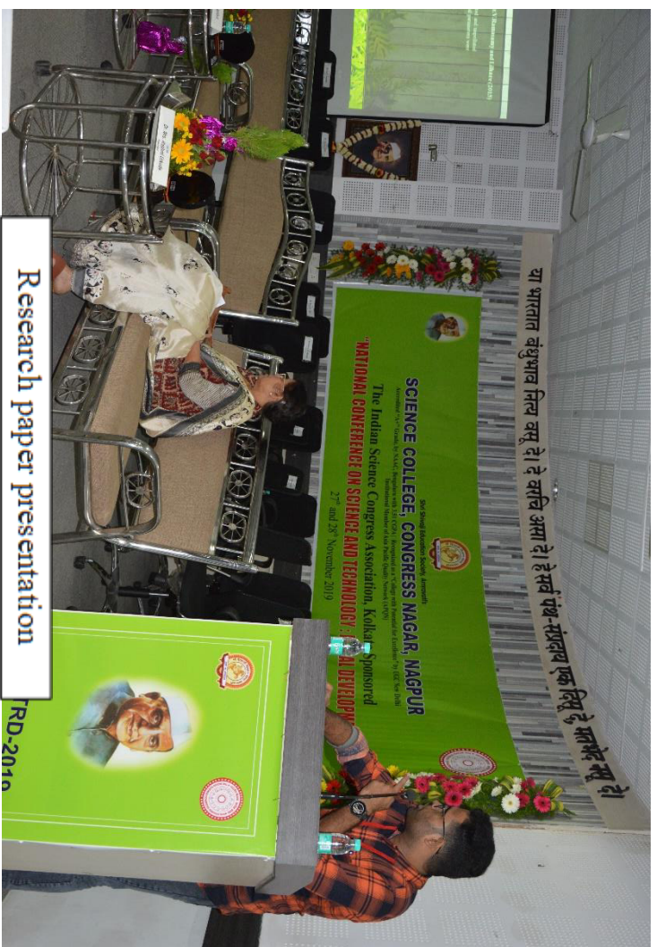
Research paper presentation