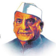
Dr. Panjabrao alias Bhausaheb Deshmukh Founder President