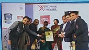
Best Engineering College with Academic Excellence in Maharashtra Award - 2018