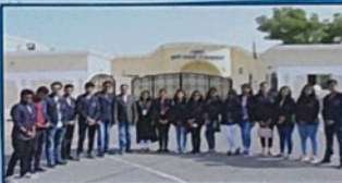
International study Tour at BITS, Dubai Campus