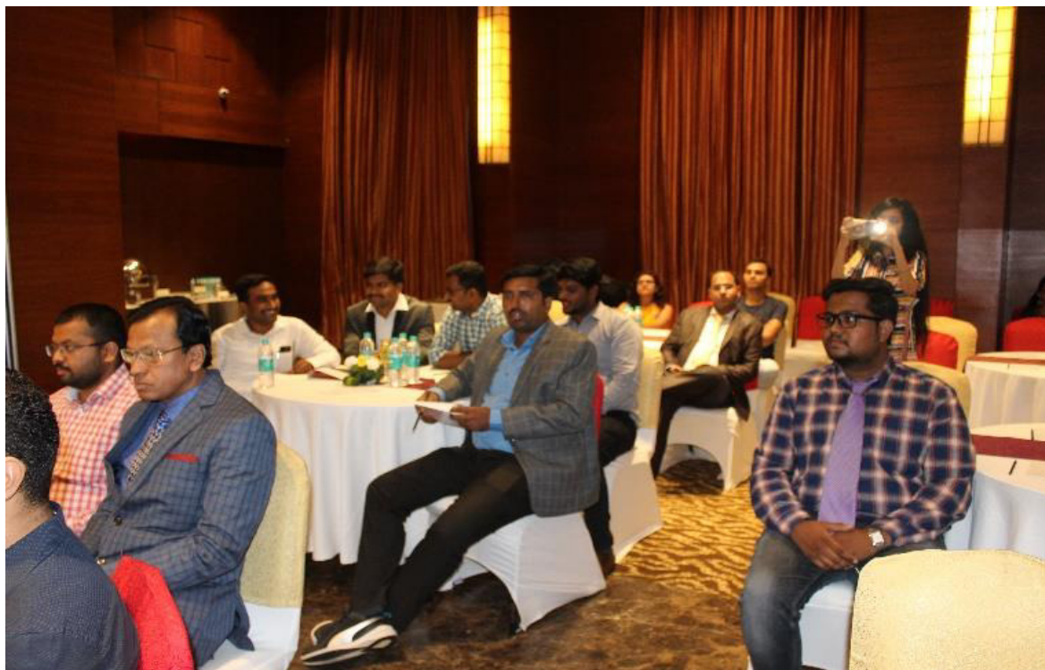
Paper presentation session