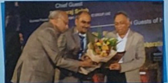
Felicitation of Padmabhushan Dr. Vijay Bhatkar