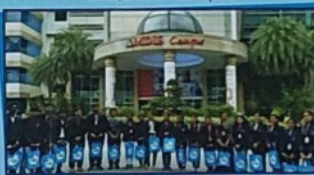
International study Tour at MDIS, Singapore Campus