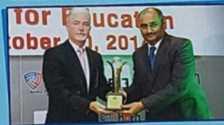
BERG Award Singapore 2014