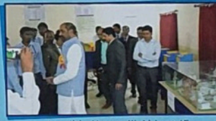
Hon'ble Hansrajji Ahir at JE for inauguration of incubation center