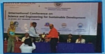
International Conference at Bangkok - Thailand