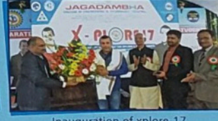
Inauguration of xplora-17 by the hands of Hon'ble Chetan Bhagat