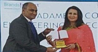
Award of Best Engineering College for Placement-2018