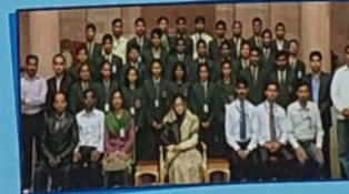
Visit to Rashtrapati Bhavan