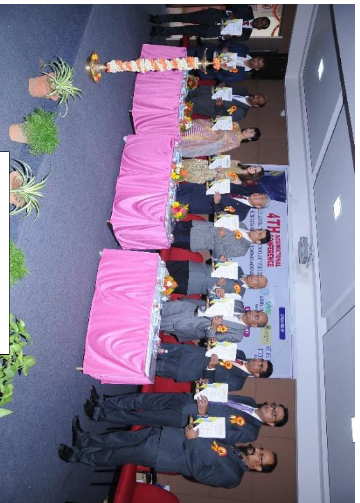
Publication of Souvenir