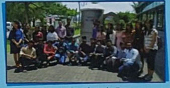
International study Tour at Malaysia