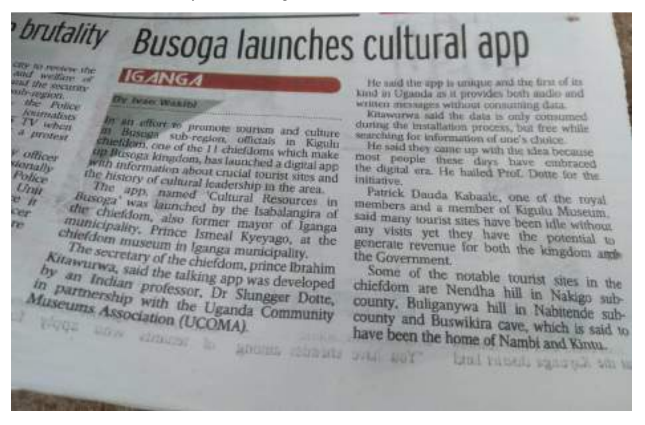
News in Uganda News Paper.