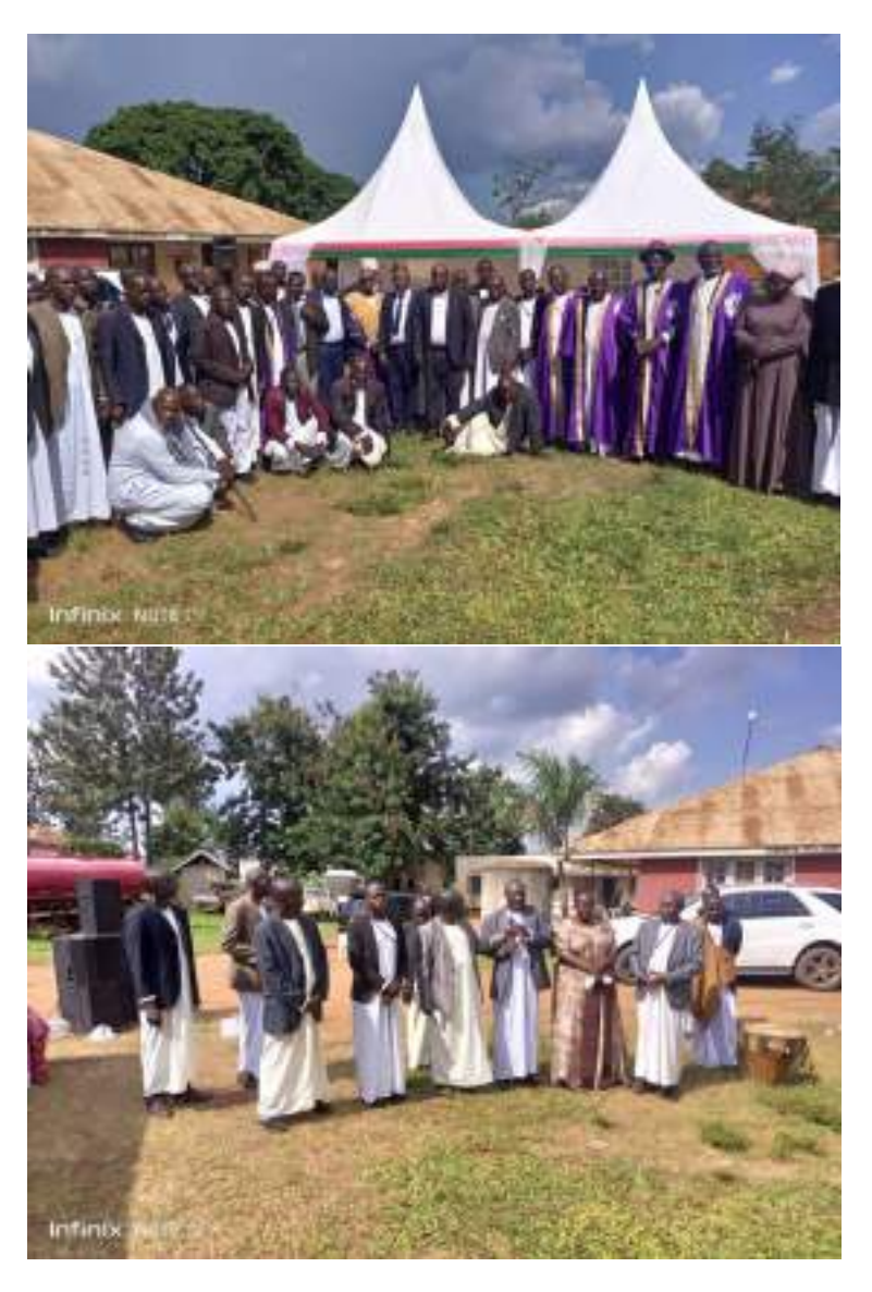
Official Inauguration of Kiguu Museum Smart Phone application @ 18/05/2023