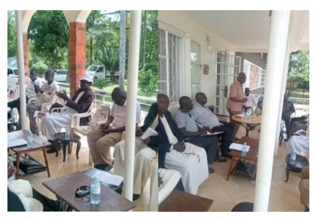
The Hereditary Chiefs of Kigulu Chiefdom assembled for the launch