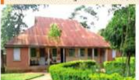
केनिवातील किमिनिमस संग्रहालवाची ही इमानत.

काशा कोल्ला स्थानस्था बेल्ले भारत्याचा प्रयोग त्यांनी प्रसान प्रथम वाराची केला. त्यानेम त्यानी 'सी मध्यावर्ती signered sincepts, it the backing echart fets returns for केलेल्य जैपपुळे क्युआर चोहरूह सहस्थाने मध्यपत्री संबद्धालय अर्थात प्राप्त पंदान्यादेश रेतिस्टीयक देश्याचे महिली अहिन्ते-विदिक्षे स्थलका