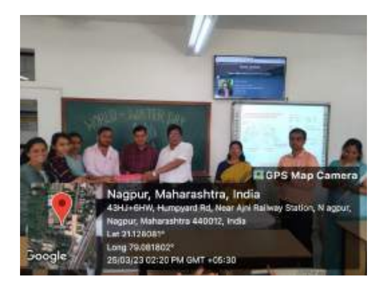
Figure 1- Distribution of Water Testing Kit on 25/03/2023

The collaboration between the Chemistry Department and the Shivaji Innovation and Incubation Centre has yielded a groundbreaking Advanced Water Testing Kit. This kit not only expedites on-field water analysis but also aligns with UNESCO goals, showcasing its broader impact on addressing global challenges related to water quality and sanitation. The willingness to share this innovation with other institutes demonstrates a commitment to advancing scientific knowledge and fostering collaborative efforts within the academic community.