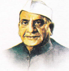
Dr. Panjabrao alias Bhausahab Deshmukh Founder President