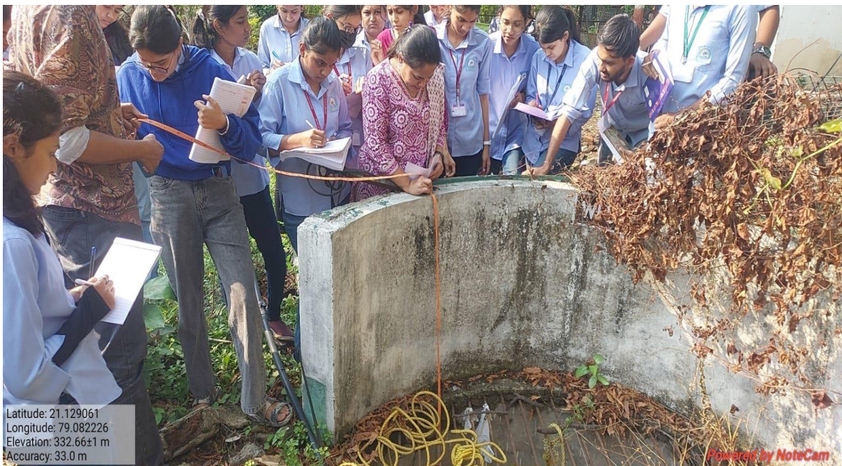
Students doing well inventory survey