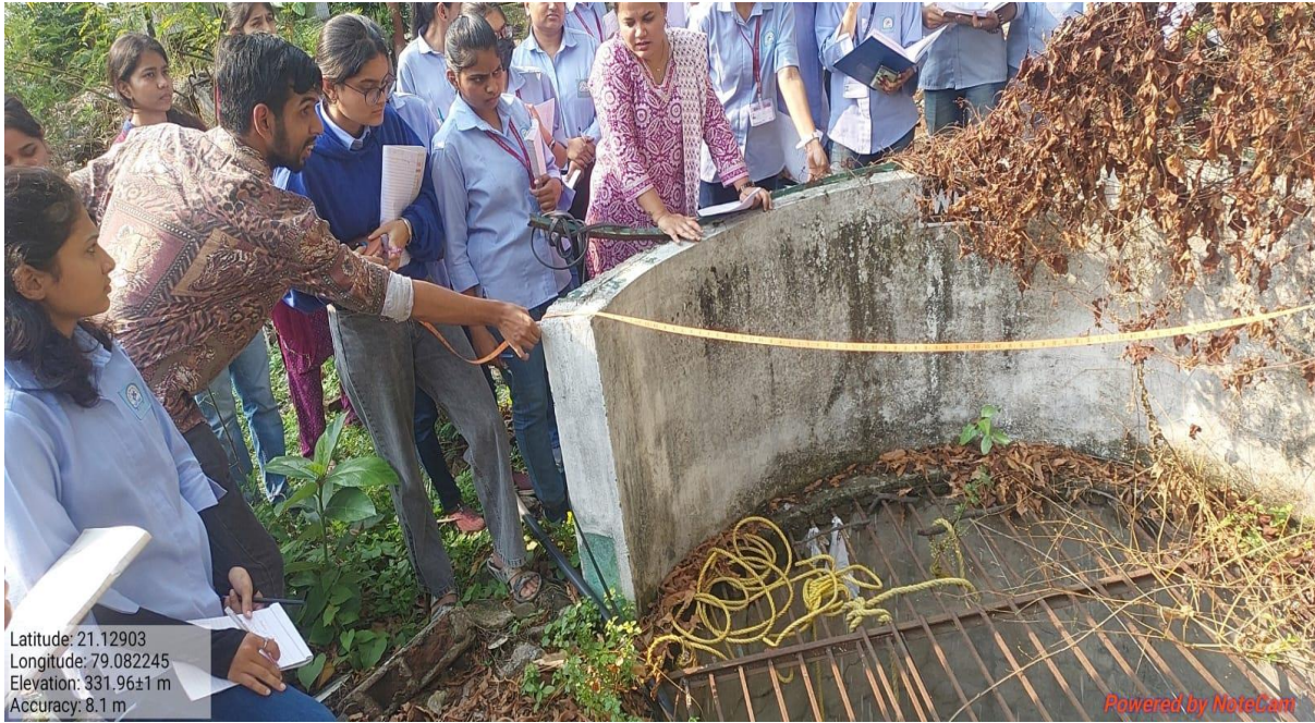
Students doing well inventory survey